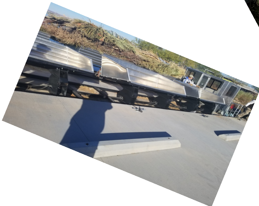
Loading bush boat