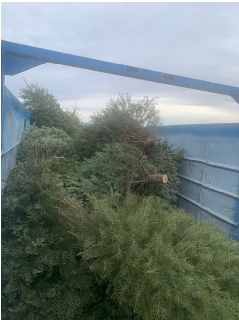
The Christmas trees are waiting to be placed in the Lake