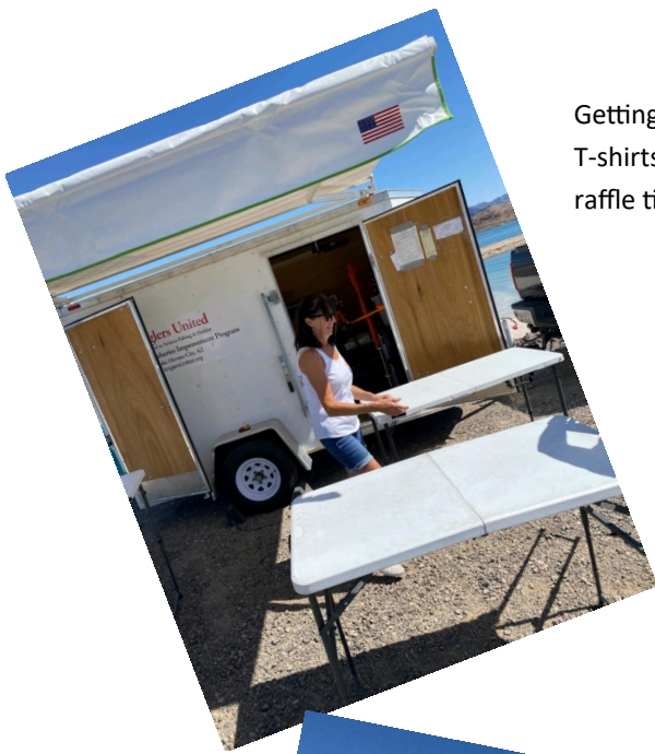
Getting set up to sell T-shirts, maps and raffle tickets