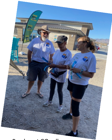
Ready, set GO sell raffle tickets