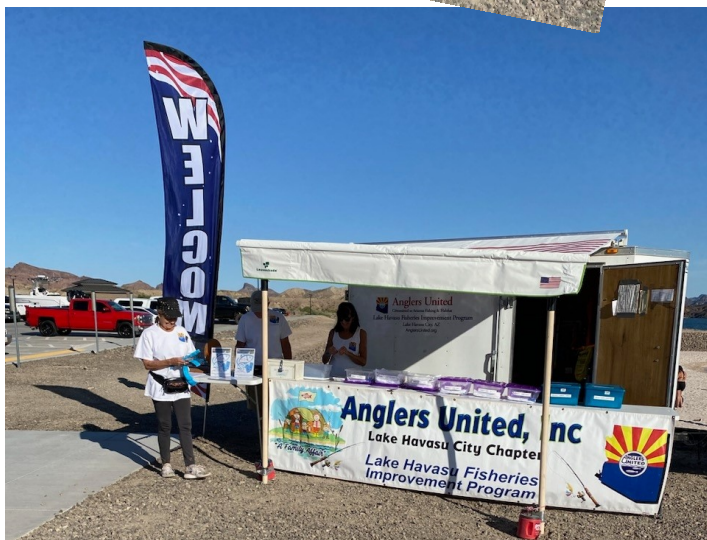
Notice our new awning and lettering on the trailer